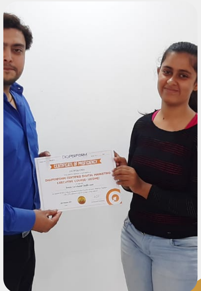
Placed as Social Media Manager