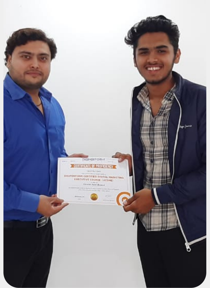
Placed as PPC Expert