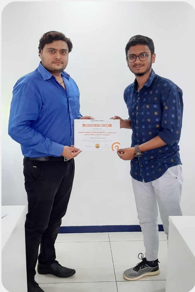
Placed as Digital Marketing Executive