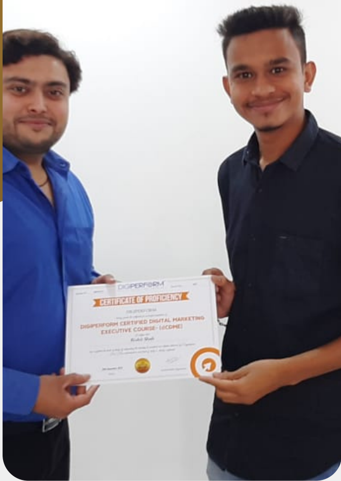
Placed as SEO Executive